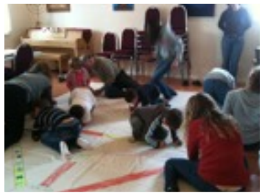
Tree of life learning 11/13/11